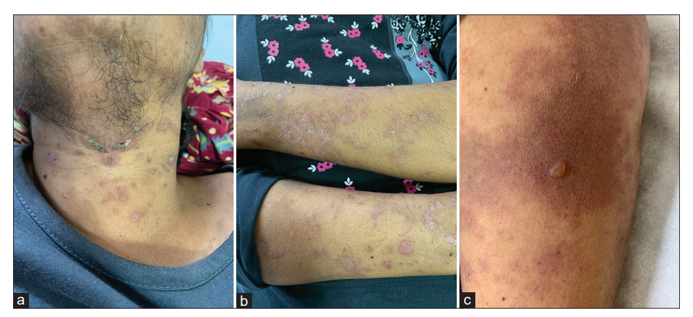
Figure 1: (a-b) Multiple, polycyclic, erythematous, mildly scaly, plaques distributed on photoexposed areas. (c) Single blister on erythematous plaque was seen on the left arm.

DILE can present as systemic LE, SCLE, chronic cutaneous LE and cutaneous LE tumidus. Drug-induced SCLE is the most common variant, and its clinical features include annularpolycyclic lesions.<sup>[2]</sup> It may present weeks to months after initiation of the offending drug.<sup>[2,5]</sup> According to a PubMed search, there are only 16 case reports of DILE after capecitabine to date. Out of which, SCLE was seen in 11 patients.<sup>[5-7]</sup> Systemic lupus erythematosus was seen in 2 cases<sup>[5,8]</sup> and discoid lupus erythematosus was seen in 3 cases. [5,9,10] Most of the cutaneous lesions occurred after 2 cycles of capecitabine. [5] Capecitabine is an antineoplastic drug that is enzymatically converted to 5- fluorouracil (5-FU), which is a pyrimidine analogue and interferes with tumour cell proliferation by inhibiting DNA synthesis. It is taken orally and is used in the treatment of metastatic breast cancer and colorectal cancer.[11] Previous animal studies have demonstrated a link between 5-FU, ultraviolet B (UVB) radiation and the development of cutaneous lupus-like lesions, as 5-FU damages the basal layer of the epidermis and makes the epidermis more susceptible to UVB damage.[12] Studies have also hypothesised that chemotherapeutic agents translocate SSA/Ro to the surface of basal keratinocytes in a manner similar to UVB light.[13,14] These hypotheses can explain the pathogenesis of photosensitive drug-induced SCLE secondary to capecitabine.