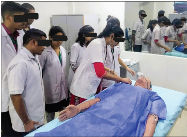
Figure 3: Students performing the simulation exercise.

compared to the pre-test, also summative assessment conducted 11 days later showed good retention of both application and recall-based questions. Feedback from these students showed that the majority of them reported that simulation enhanced their learning of the concepts of basic sciences. [11]