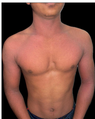
Figure 1: Erythematous scaly rash distributed symmetrically over chest, neck and arms.

The diagnosis of SDRIFE primarily relies on the history and clinical picture. Treatment is symptomatic, such as antihistamines, emollients, and offending drugs should