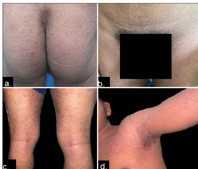
Figure 2: Erythematous scaly rash involving (a) buttocks, (b) groins, (c) popliteal fossa and (d) axilla.